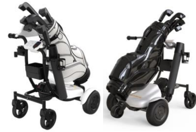
Fig. 1 Robot-based mobile cart platform

platform to drive image acquisition. The robot platform was driven at a constant speed of 1 m/s during data acquisition and driving tests. Also, Table 1 shows the technical specifications of the test environment mobile hardware.