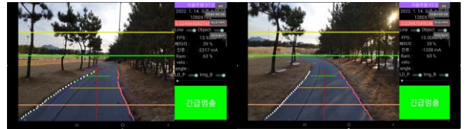
Fig. 3 Detection results